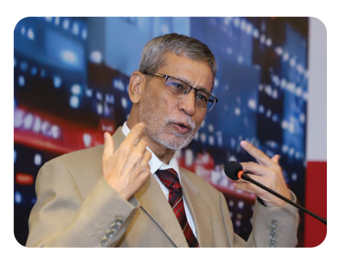
Former Agriculture Secretary Siraj Hussain "The Government is not short of storage capacity. The problem is how to maintain a decent price for farmers."